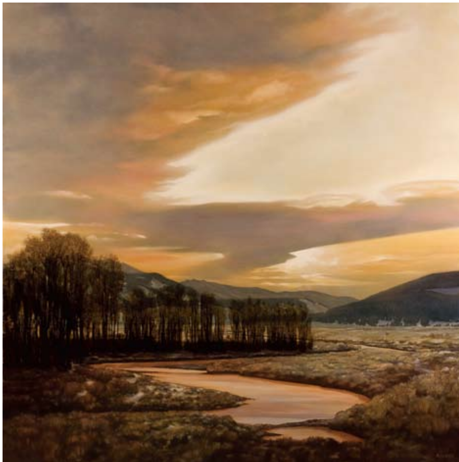
MOMENT OF REFLECTION, OIL ON CANVAS, 48 X 48"