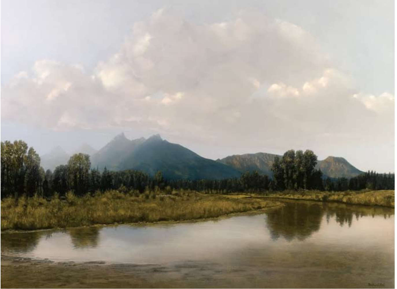
TETON JOURNEY, OIL ON CANVAS, 32 X 40"