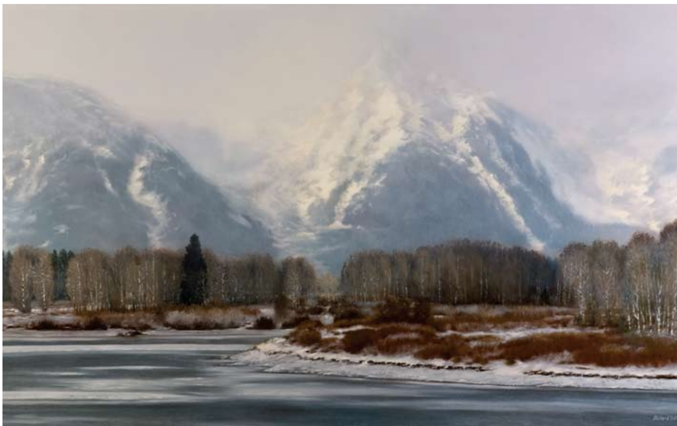
TETON AWAKENING, OIL ON CANVAS, 30 X 40"