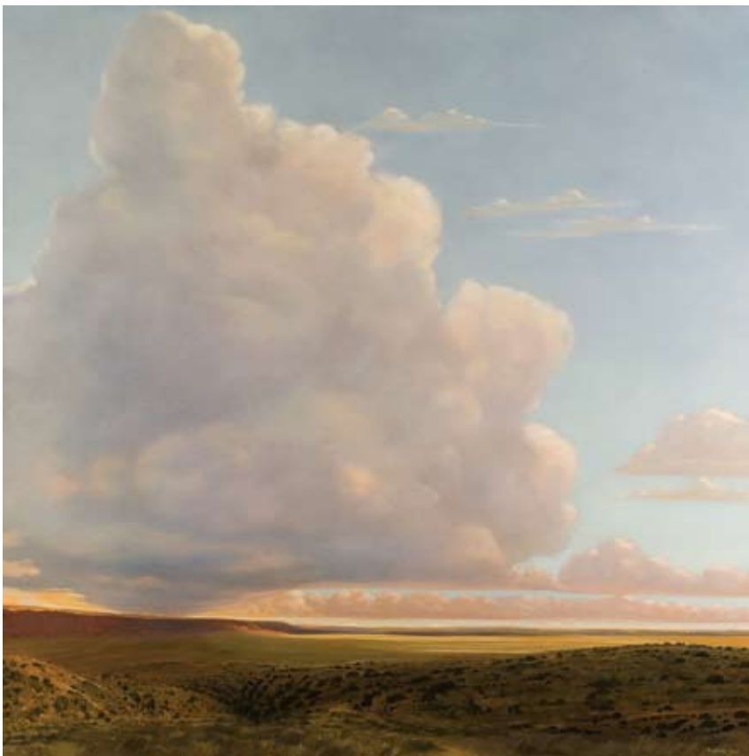
VERMILLION VISION, OIL ON CANVAS, 40 X 40"

how particular colors react with one another and change tones when put under layers of glazes.